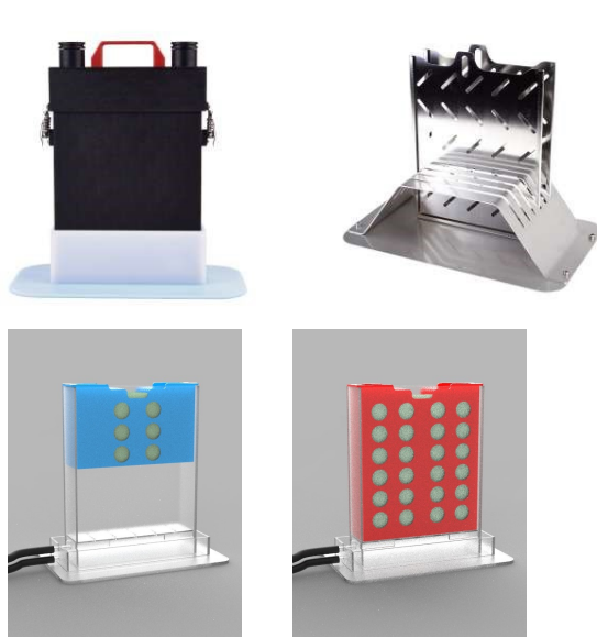
Washing Tank (new)